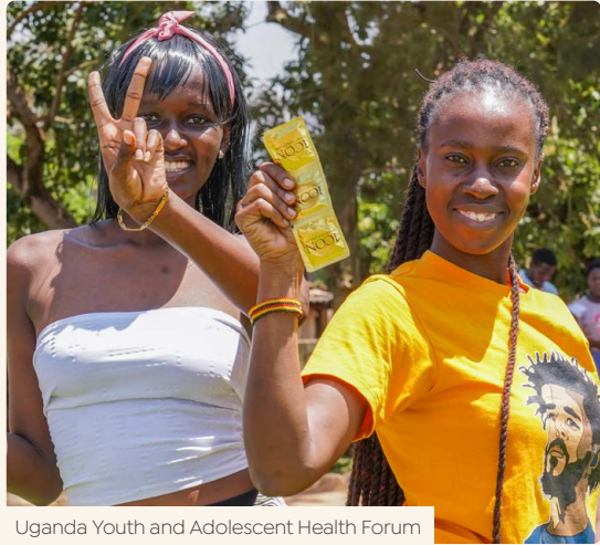
Uganda Youth and Adolescent Health Forum

How the Alliance’s collaborative power accelerates progress