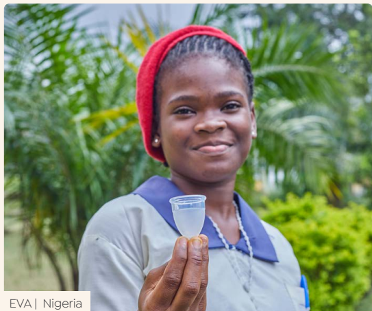
EVA | Nigeria

Products sold to Alliance members and other organizations include condoms, injectable and oral contraceptive methods, medical abortion medications, intrauterine devices, and menstrual cups.