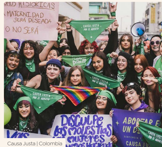
Causa Justa | Colombia

To celebrate and leverage the strategies employed more broadly, Fòs Feminista Canada financially supported the ‘Freedom is Unstoppable’ gathering. This pivotal event provided a platform for local and regional organizations to exchange insights and strategies, advocating for accessible abortion across Latin America.