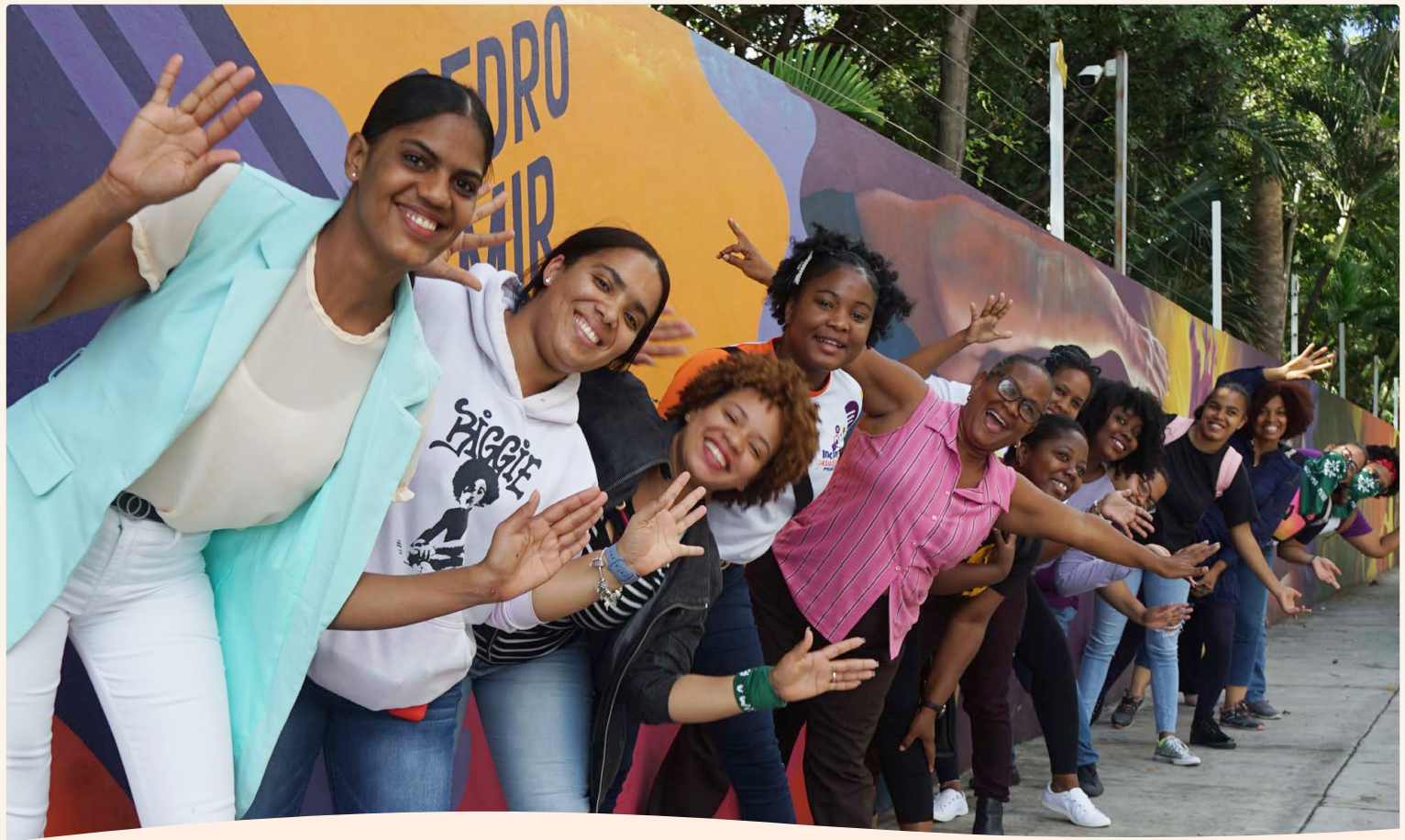
Dominican Republic

In the face of limited budgets and restrictive legal frameworks, Alliance members employ impactful methods to ensure access to essential information, services, and care related to contraception, abortion, and sexual and gender-based violence. They are dedicated to serving the most marginalized communities, including Afro-descendants, LGBTQI+ individuals, Indigenous peoples, migrants and refugees, persons with disabilities, and those living with HIV/AIDS.